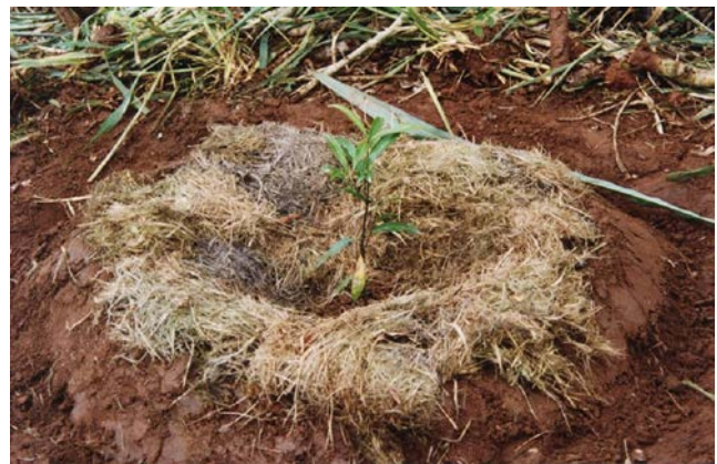
Figure 2. “Inverted hollows” for seedlings in soaked areas. Pictured here is Canelinha ( Nectandra megapotamica ).

In seventeen years, we can observe that there was riparian vegetation recovery (Figure 1), which has allowed the dispersal of flora and fauna between the remnant forests. The tree seedlings grew and the community structure developed well despite the soil and water differences of the site. We did not have any death due to rotten stems. The different species chosen and the appropriated handling of the planting and drainage made the recovery of the heath forest possible. Intensive use of the restored forest corridor by native fauna has been observed. Otaviano and Barros